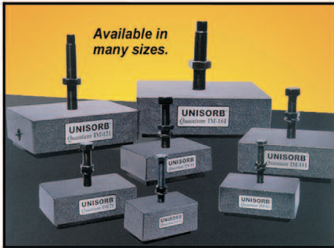
U.S. Patent No. 5,794,912

UNISORB'S line of Quantum IM Mounts offers substantial improvements over older models, and a quantum leap over the competition. These dynamic patented designs incorporate several features highlighted by the following.